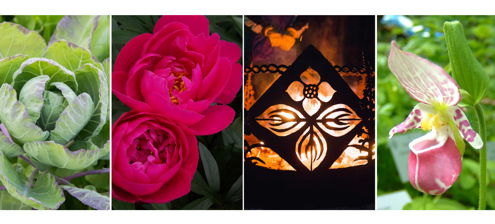
2019 Gross Income $632,369